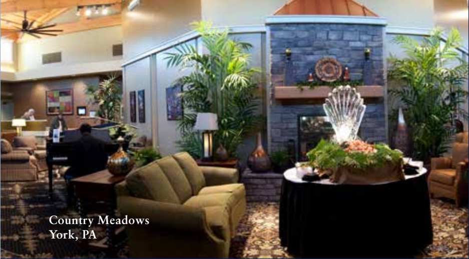
Country Meadows York, PA

Features of the building include a 76 foot bell tower, custom lighting and windows, standing seam metal roofing and exposed trusses. The sanctuary is lit by custom lighting, skylights, and windows.