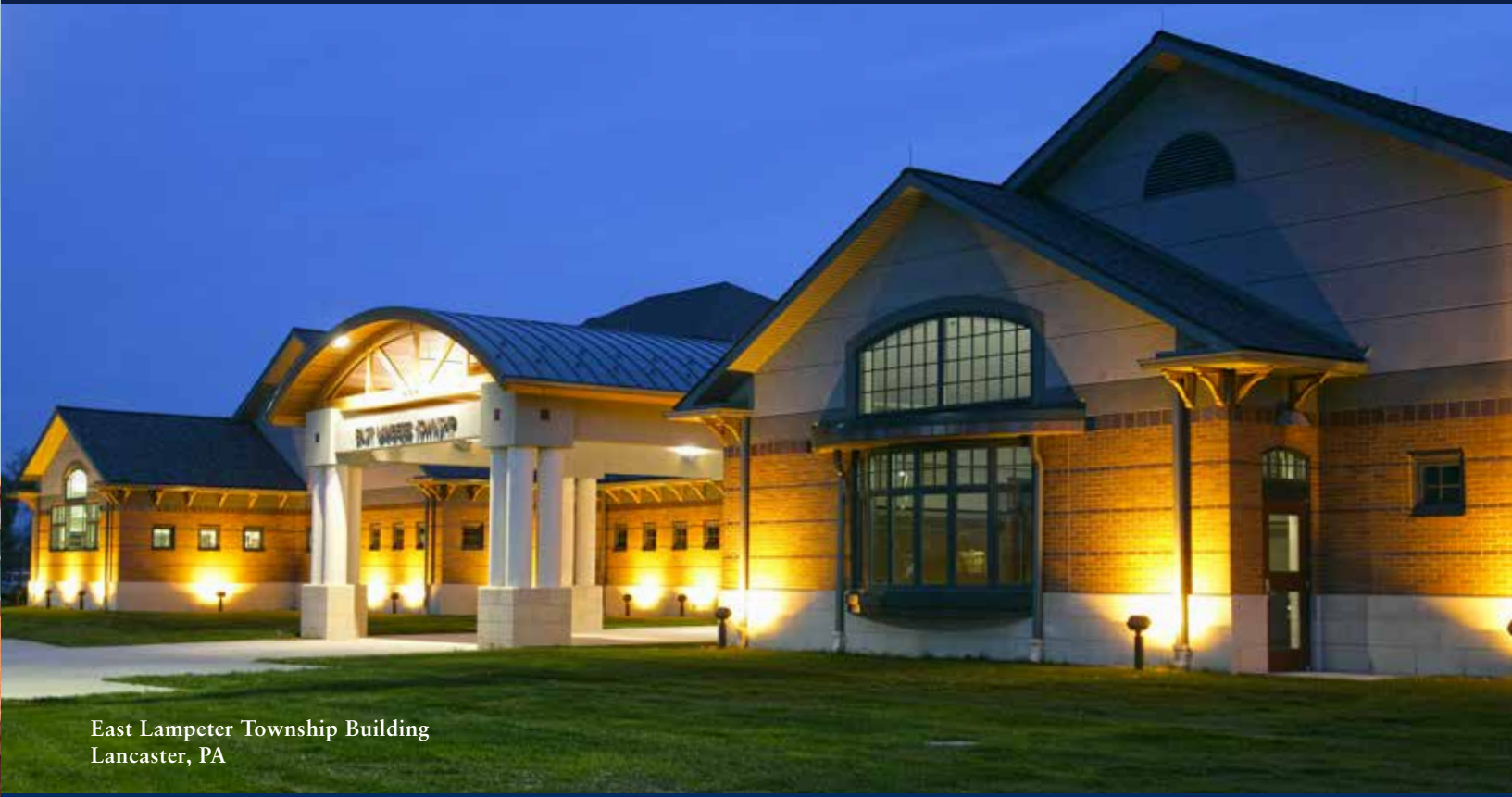
East Lampeter Township Building Lancaster, PA

“Our sincere thank you for your professionalism, reliability, and the quality of your work. eci delivered on all fronts.”