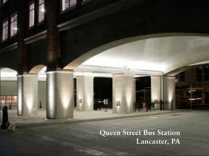
Queen Street Bus Station Lancaster, PA